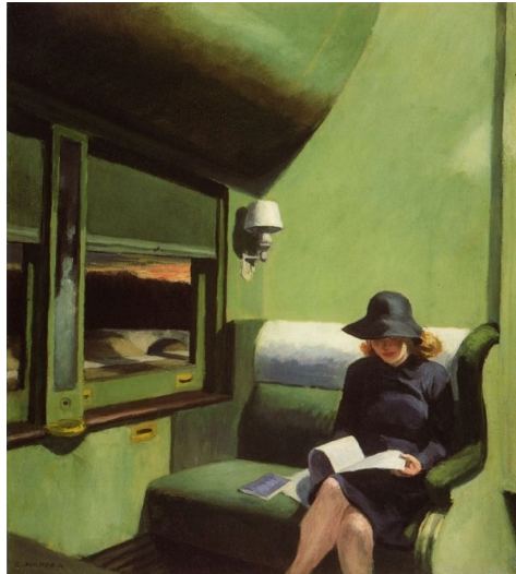
Compartment C, Edward Hopper—1938