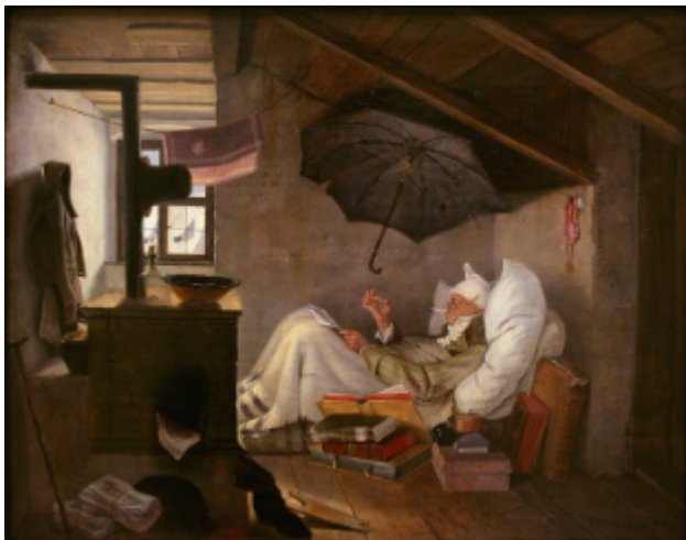
The Poor Poet—Carl Spitzweg—1839